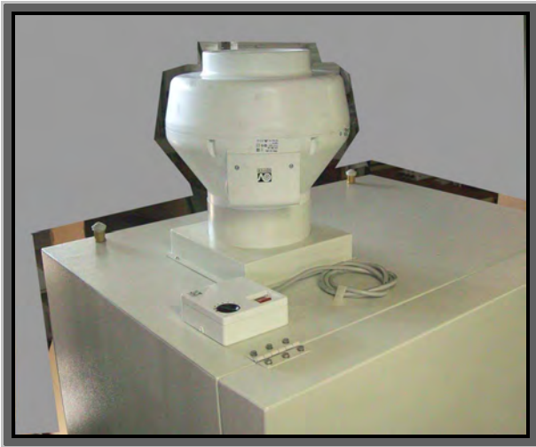
Additional fan with switch/speed regulator, positioned on the cabinet roof.